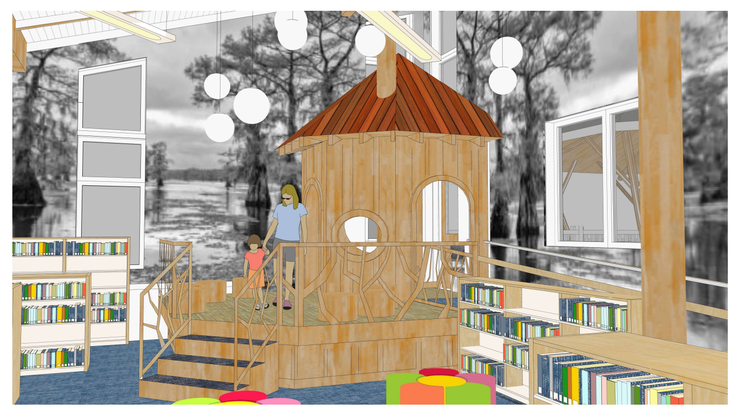
Interior View of Storytime Treehouse