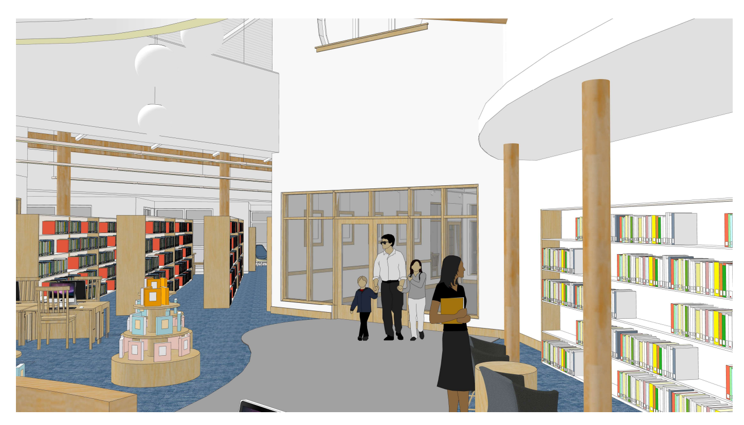
Interior View of Library Entrance