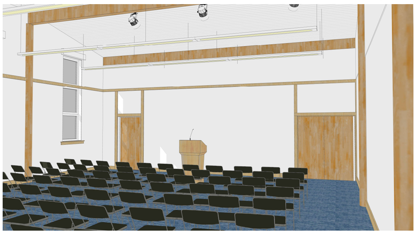
Interior View of Community Room