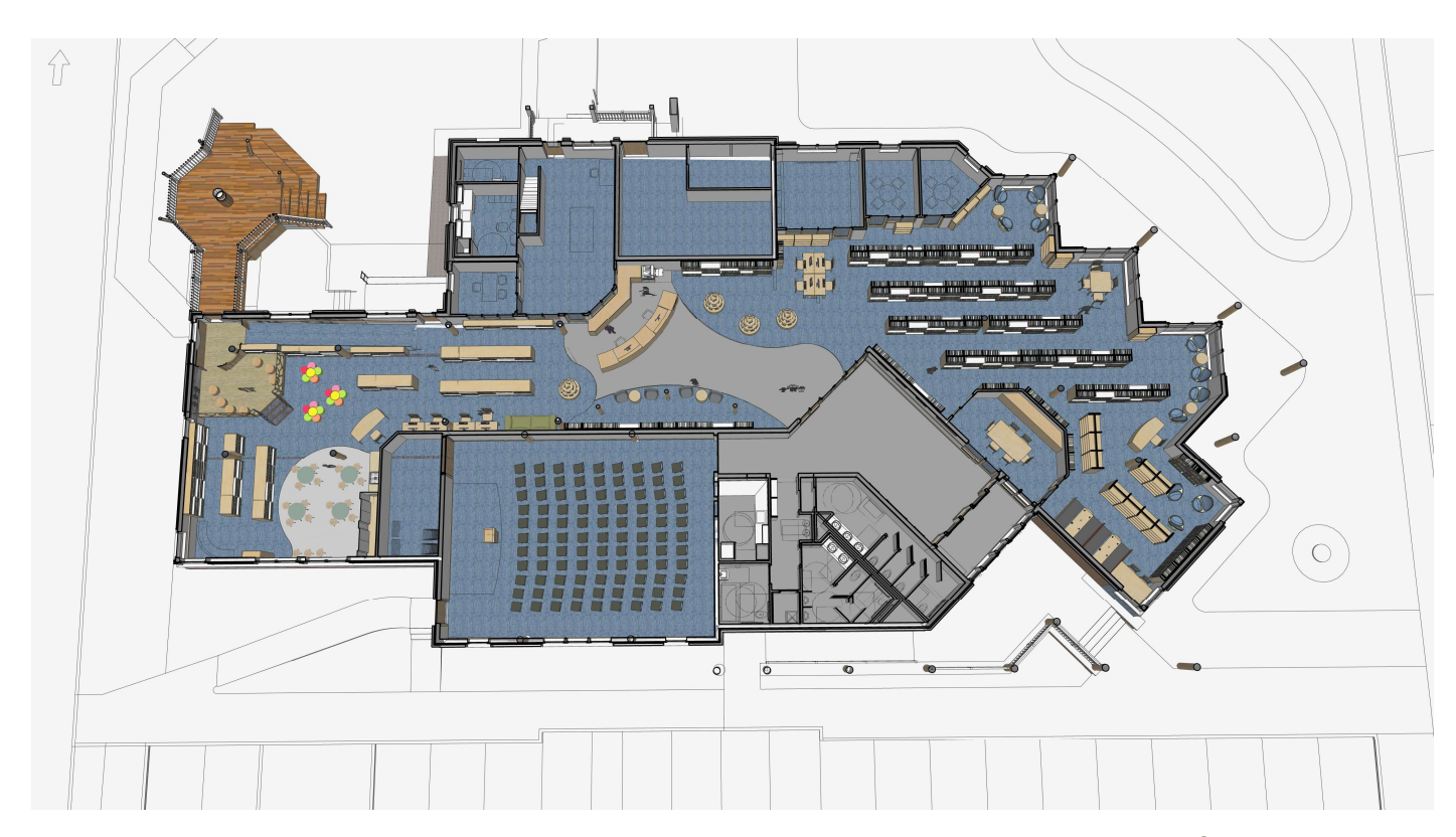
Projected View of First Floor Plan