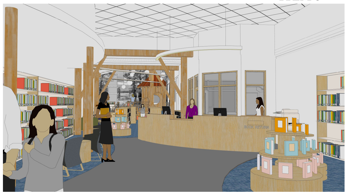
Interior View of Circulation Desk