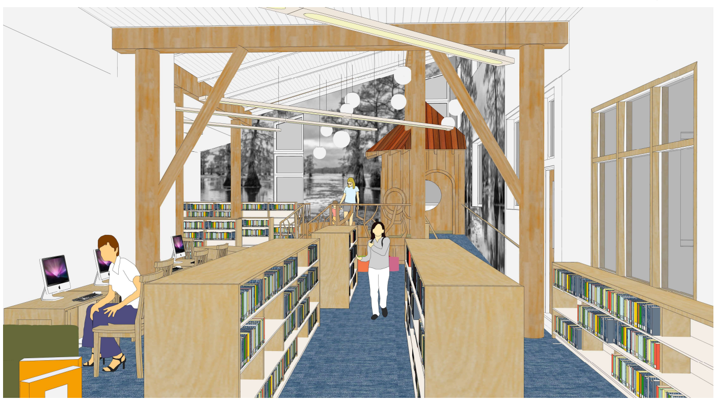
Interior View of Children's Collection