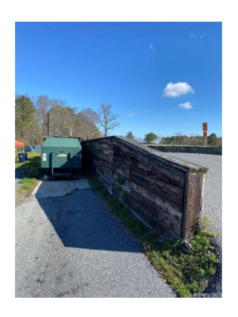
Exhibit B: Existing Berlin HOCC Bulkhead Walls