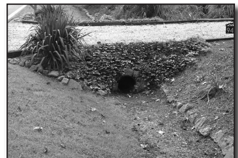
Adjacent property owners can reduce pollution by avoiding over-mowing, fertilizing or placing stone, wood or cement in the R.O.W.