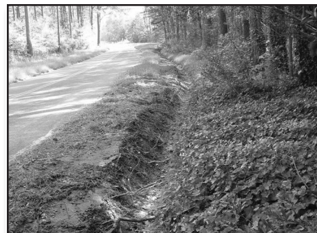
Bare soil in this ditch will erode and contribute to pollution downstream.

The open drainage system is suited to our coastal, rural landscape. It also helps protect water quality by slowing the movement of stormwater and providing some settling of sediment and uptake of pollutants before it reaches creeks or bays. Unlike dense urban areas, Worcester County does not use closed pipe systems to convey stormwater. Closed pipe systems are expensive and they can cause costly damage to water quality.