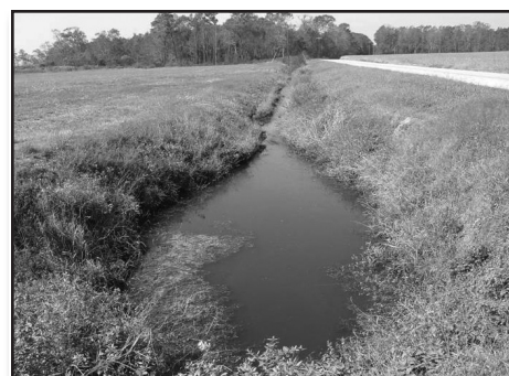
Sediment traps and protective buffers improve water quality downstream.